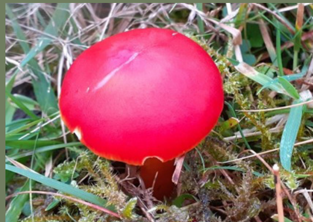
Male Marsh harrier

Other groups visiting the reserve included a research team from Huddersfield University who were surveying the stream network in preparation for installing "leaky dams" for Slow the Flow: an organisation working on flood prevention. 500 dams have been installed in Hardcastle Craggs and the team is now looking at other watercourses which flow into the River Calder. The scientists spent several hours taking samples for water quality and invertebrate river-life, looking at possible areas for the dams, and measuring the depth and flow as the water passes down Broadhead Clough. CROWS have also installed a new finger signpost at the entrance making it much clearer for visitors looking for Whams Wood and Erringden Moor.