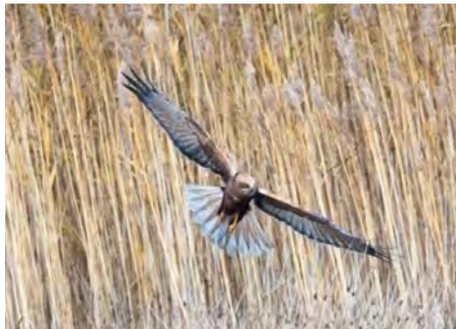
Male Marsh harrier

Plantlife is the organisation speaking up for our wildflowers, plants and fungi. It is drawing attention to the term "plant blindness." What do you see in the picture? The single marsh harrier, or the thousands of grasses and seed heads within the reed bed? 99.7% of the biomass of our planet is made up of plants on which we and all wildlife depend.