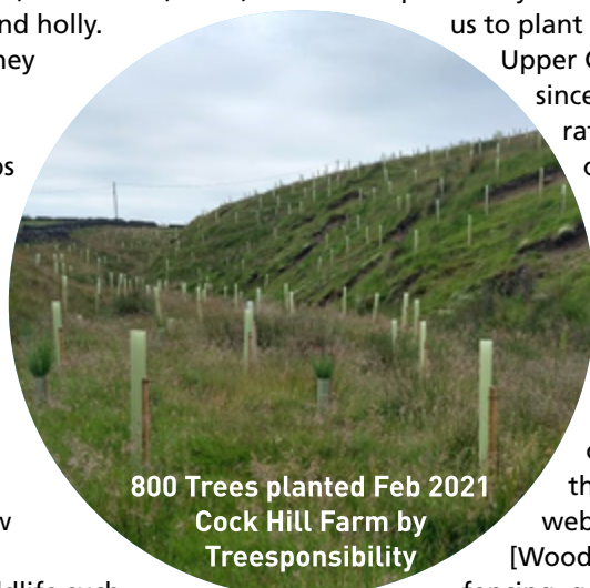
800 Trees planted Feb 2021 Cock Hill Farm by Treesponsibility