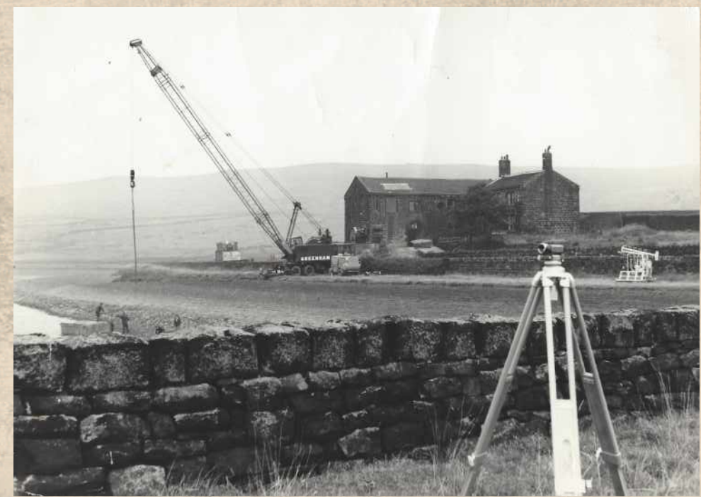
Morley Corporation Withens Reservoir, a large machine on site with a 120 ft. arm reaching down into the core centre of the dam

We lived in the Reservoir Keeper's house at Green Withens in Rishworth until 1963 when Dad transferred here to take up his new role in the Water Treatment works following Wakefield and Morley corporation merging into Wakefield and District Water Board. Before the new treatment works officially started on 25/10/1963, I can remember the lime lorries driving up between our house and the barn, reversing on the ramp at the back of the barn to the top level. Each morning lime used to be mixed into a tank at the top of the barn. Two large water wheels with small cups turned slowly under water power and the cups added the lime over a 24-hour period into two large water tanks. The lime and water then left another large tank that flowed down a pipe to the old treatment works. This explains why old maps and photographs show a large tank up in the