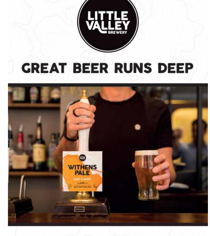
ASK FOR IT AT YOUR LOCAL! www.littlevalleybrewery.co.uk

The Ark, Dean Hey Farm, Mytholmroyd, HX7 5RU www.thearkexperience.co.uk T 01422 882010 Open 51 weeks 7am-6.30pm