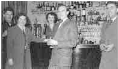
local people at the bar in the Hinch