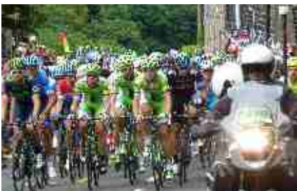
Tour de France