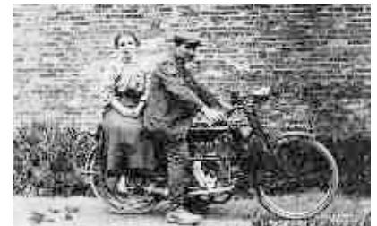
Man & Woman on Motorbike