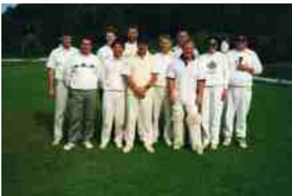
The Hinchliffe Cricket team 1980's