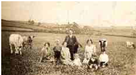
Farming Family at Wood Top