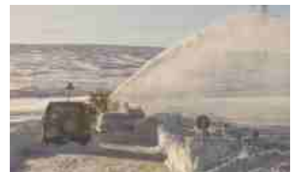
Snow Blower 2010