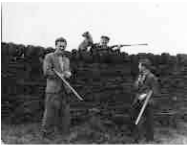
A Group of Shooters