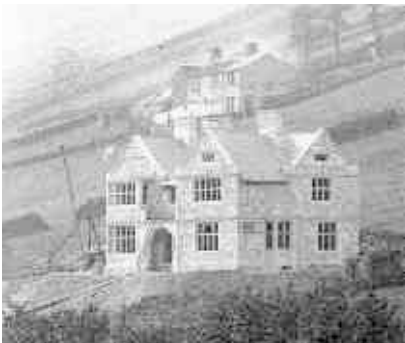
The Old Vicarage under construction (1901)