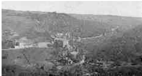
Former Mills in the Vale