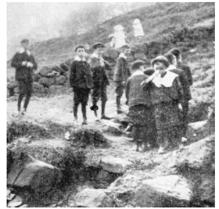
Local children in their Sunday Best

All you needed was a medicine bottle, filled with the spa water, liquorice was added (to make it more palatable for drinking) then the mixture was thoroughly shaken and - if you didn't want to look like a cissy! - swigged down in one. The sulphurous water from the spa was deemed to be excellent for making tea, although some recommended a pinch of bicarbonate of soda to take the edge off the "bad eggs smell".