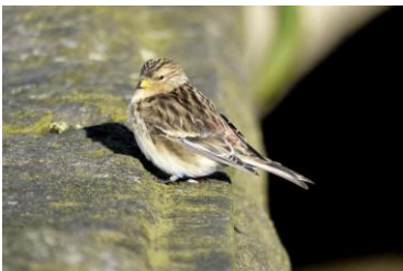
Twite, Warley Moor

Can you find these hidden words relating to the Twite - all of which appear in this article? They run upwards, downwards, side to side and diagonally.