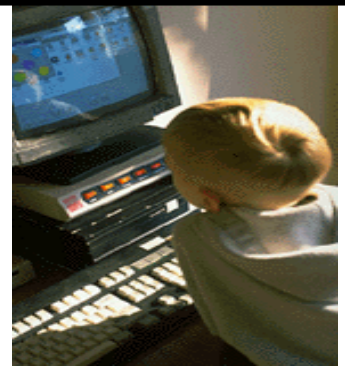
Cragg Vale's New Community Website. www.craggvalecommunity.co.uk